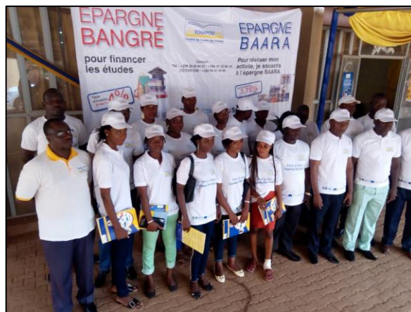
The team of the General Direction of La Poste at the start of the marketing campaign

SONAPOST (Société Nationale des Postes), now known as La Poste du Burkina (the Burkina Faso Post Office, hereafter La Poste ), was established in 1997. Through its mission of collecting savings, it has become an important economic player in Burkina Faso, employing 1'200 persons. La Poste has set itself the goal of offering quality services to citizens and of becoming a leading driver of development at the national level. In 2017, La Poste had 112 functional agencies spread over the 13 regions, making it the densest network of any deposit-taking institution at a national level. There are more than 458'612 accounts for a combined savings of more than 129'443'797 € (145'491'000 CHF) managed by the Caisse Nationale d'Epargne (National Savings Agency, CNP) vii and more than 4,265 accounts for a total savings of 105'026'242 € (118'046'500 CHF) managed by the Centre des Cheques Postaux (Centre for Postal Checks, CCP).