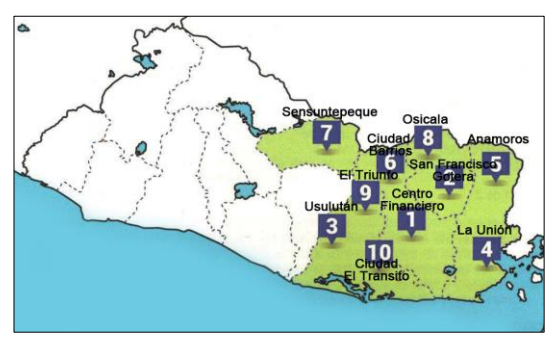
Figure 3: Credicampo branch network El Salvador 2015

Credicampo was created in February 2013 as a result of the growth and development of the credit program of Fundación Campo, an entity that has provided financial and social support to rural communities. Through its participatory community credit methodology, the institution facilitated access to credit for small agricultural producers and rural microentrepreneurs. Credicampo finances its operations through 1) local sources; 2) foreign sources; and, since 2014, 3) fixed-term deposits from partners. The largest source is foreign, amounting to USD 18.23 million in 2016, or 83% of its total financing. To date Credicampo has 10 branches, distributed in the eastern and paracentral zone of the country.