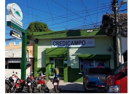
Figure 4: Credicampo branch - San Miguel