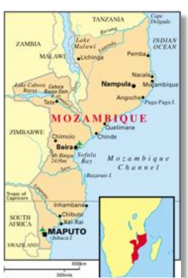
Map of Mozambique: The first branches of MBFM are in Nampula and Nacala, progressive expansion in the Nampula-Nacala Corridor, an area with agricultural potential, is foreseen

Most of MBFM's clients pursue asset-building strategies to escape poverty, but they lack adequate risk mitigation instruments to manage lifetime events like death of a family member with high funeral expenses, accidents, invalidity, natural disasters, etc. Therefore, SCBF supported MBFM research on forms of vulnerability, their costs and available traditional coping mechanisms. The approach targets designing financial products covering key lifetime events that are responsible for 80% of their draw backs into poverty: death of a family member with related funeral costs, terminal illness and definitive inability to work. These events have mainly two major impacts on households and micro businesses: