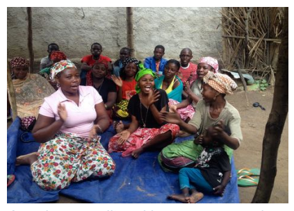
A savings, credit and insurance group in Nampula city that was involved in the product development research